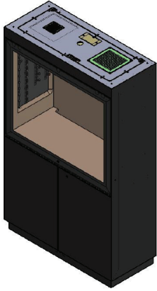
Figure 1 – Jewel Box CR.050.5