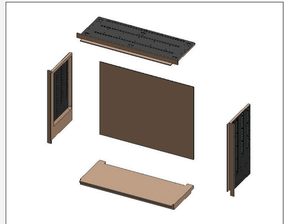
Figure 2- Interior