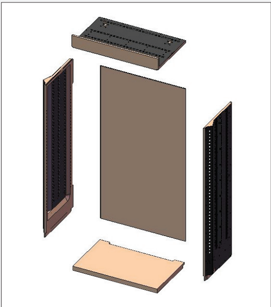
Figure 2- Interior